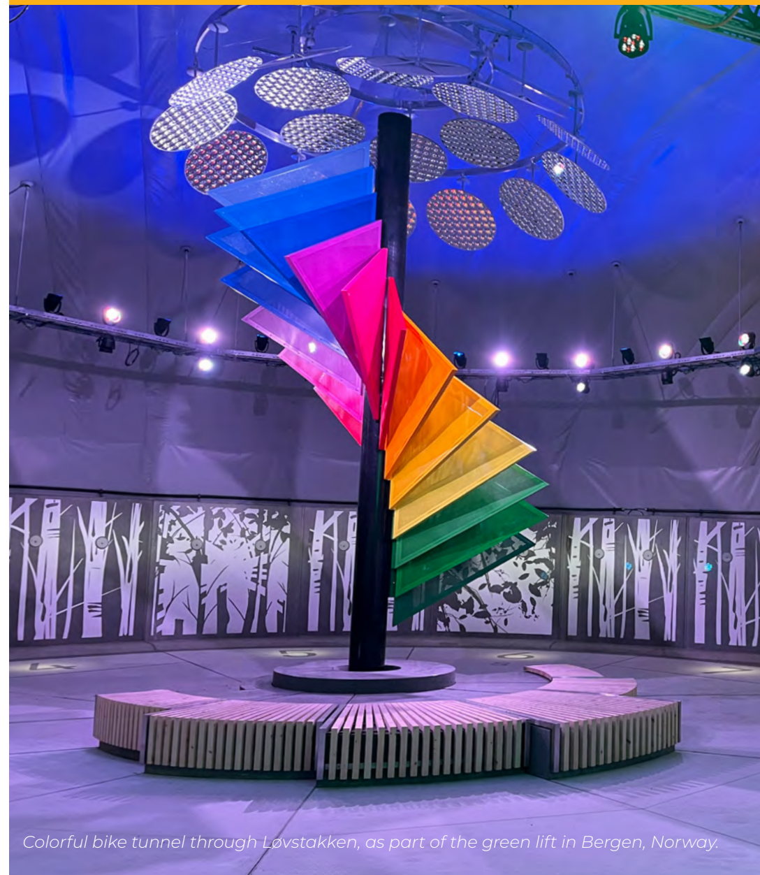
Colorful bike tunnel through Lovstakken, as part of the green lift in Bergen, Norway.

Like many professional networks, NEVIR's activities during the pandemic were quite limited as the community typically thrives on physical get-togethers. With the pandemic behind us and a new NEVIR Board in charge, it was great to participate at this event to brainstorm how NEVIR can continue to benefit its members. During these two years, the IR community changed quite a lot with several new people in the IR teams of listed Dutch companies. In addition, the large number of IPOs in the Netherlands over the past years has led to an expansion of the IR community. NEVIR, together with Euronext, are in a unique position to bring this community together and provide a platform for active knowledge transfer.